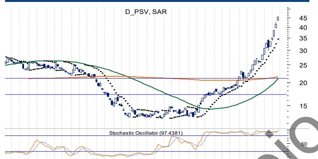
20|9 |M |A |M |J |J |A |S |O |N |D |2020 |M |A |M |J |J |A |S |O |N |D |2021 |M |A |M |J |J |A |S |O